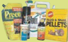
Lawn & Garden Products