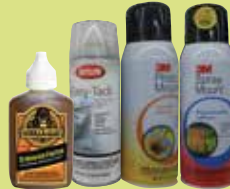
Glues and Adhesives