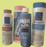
Pool & Spa Supplies