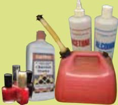
Flammable Liquids Limit: up to 30 gallons of gasoline