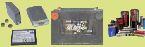
Batteries: Household & Car Limit: 5 car batteries