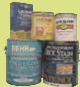
Oil-based Paints & Stains No Latex