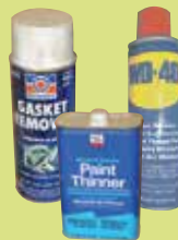
Thinners & Other Solvents